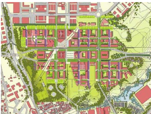
Area Development Romanina, Rome, Italy

Since its foundation in 1980, Fakton educated over 25.000 professionals throughout the Netherlands. Fakton provides teachers to the universities of Amsterdam and Rotterdam. Increasingly, Fakton is asked to give its authoritative real estate training courses outside of the Netherlands. For instance, in 2007 Fakton educated over 100 real estate developers of ING Real Estate Development throughout Europe in the cities of London, Milan, Paris, Madrid, Prague, Warsaw, Brussels and Frankfurt.